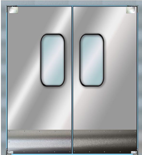
MODEL 9000A shown with optional 10x30 windows and 12" stainless steel impact plates.