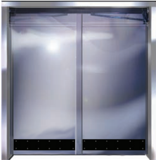
Model 2000 shown.