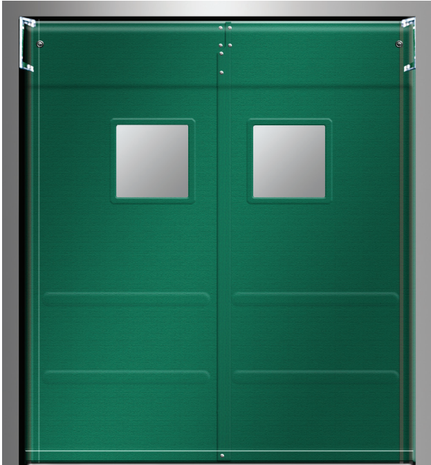
Model 1200 shown.