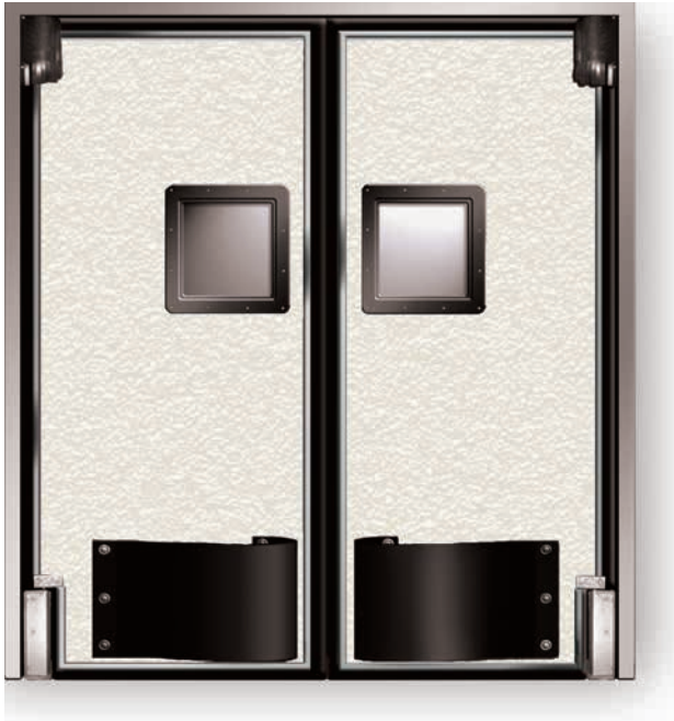
Picture shown is Model 9100V it has an optional 14" x 16" vision panel and 18" high teardrop bumpers.