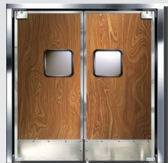
Model 9000HPL Thickness 1" High Pressure Laminate Medium Duty