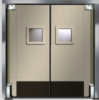
Model 6000 Thickness 1/4" ABS Plastic Medium Duty