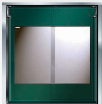
MODEL 2400 High Visibility .275 Clear PVC 2400 LT - Low Temperature Medium Duty