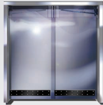
MODEL 2000 1 Ply .080 or .120 Clear PVC Light Duty