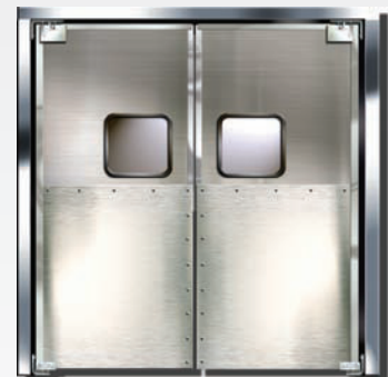
Model 9000 ALC Thickness 1" Aluminum with Stainless Steel Medium Duty