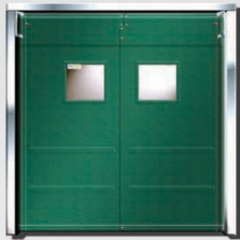
MODEL 1200 2 Ply Belting Material Heavy Duty