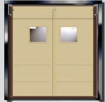
MODEL 1100 2 Ply Textured PVC Medium Duty