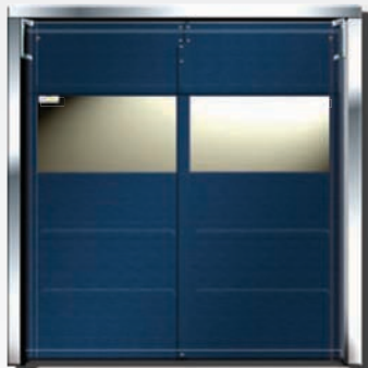
MODEL 2200 .160 Clear PVC 48" High Impact Plates Medium Duty