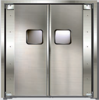
Model 5000 Thickness .063 Aluminum Sheet Light Duty