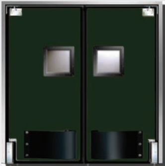
Model 8000 Thickness 1 3/4" Structural PVC Frame High Impact Plastic Facing Light Duty Motorized Traffic