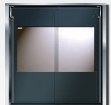
MODEL 2600 High Visibility .375 Clear PVC Optional Abuse Plates 2600 LT - Low Temperature Heavy Duty