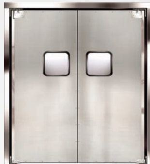
Model 9000SS Thickness 1" Stainless Steel Medium Duty