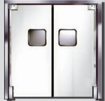
Model 7000 Thickness 1/2" High Density Polyethylene Medium Duty