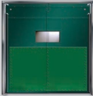
MODEL 750: 1 Ply Vinyl Coated Nylon 48" High Impact Plates Medium Duty