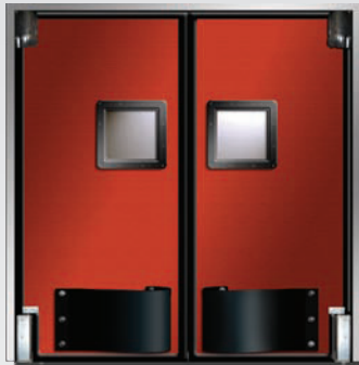
Model 9000 Thickness 1" High Impact Plastic Facing Heavy Duty